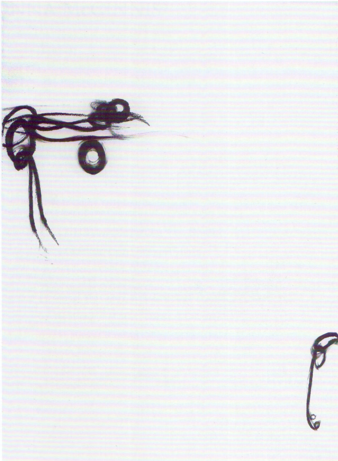
26. Swingers (Knotted Pulleys)