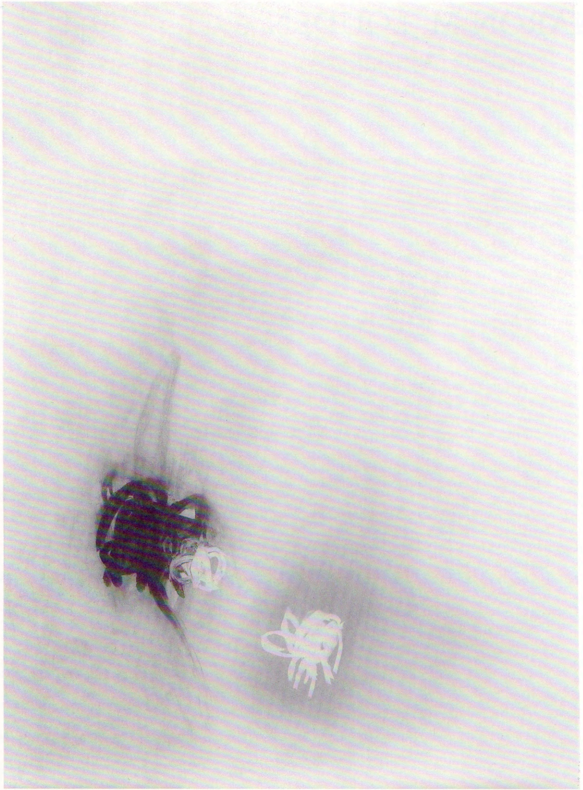
24. Crawlers II