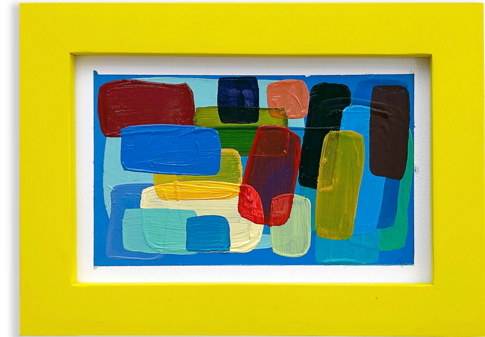
Barriers to Entry, 2023 Oil on paper 3.5 x 5.5 inches (8.89 x 13.97 cm) unframed 5.25 x 7.25 inches (13.34 x 18.42 cm) framed SS-SL-23-25