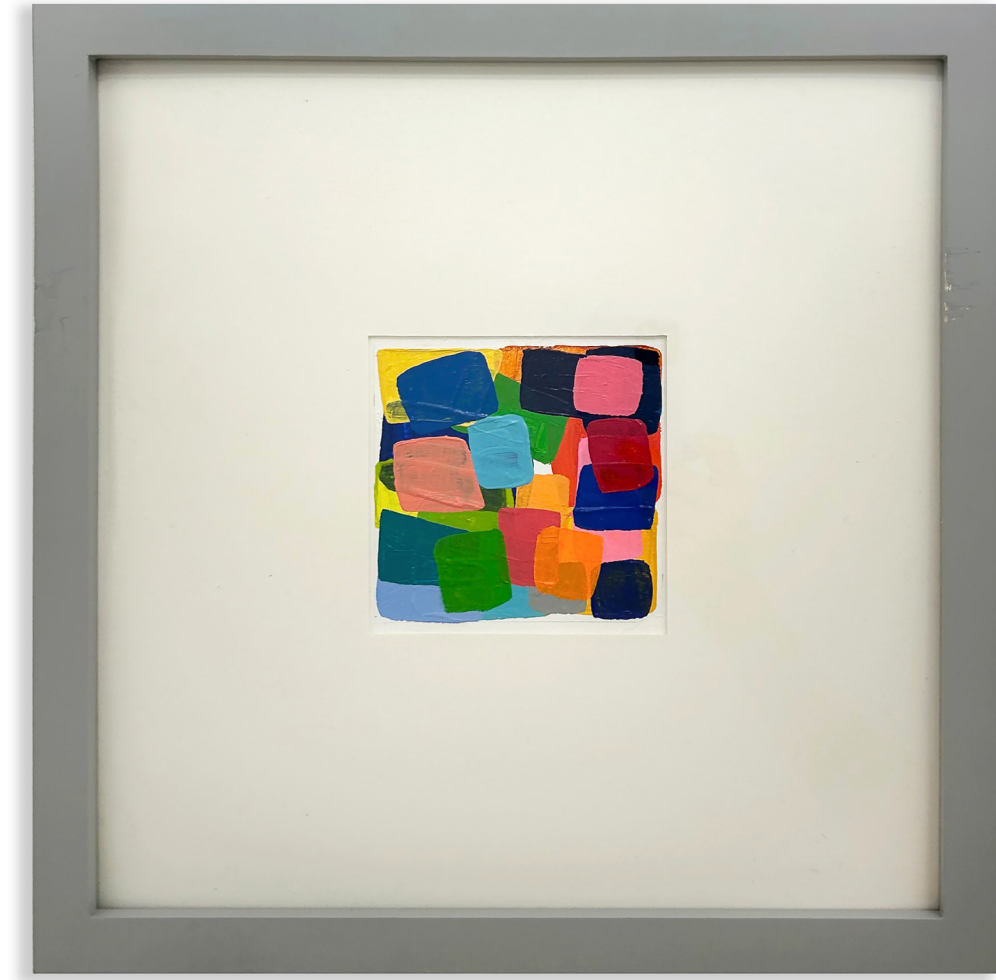
Barriers to Entry, 2023 Oil on paper 4.5 x 5 inches (11.43 x 12.7 cm) unframed 12.25 x 12.25 inches (31.12 x 31.12 cm) framed SS-SL-23-15