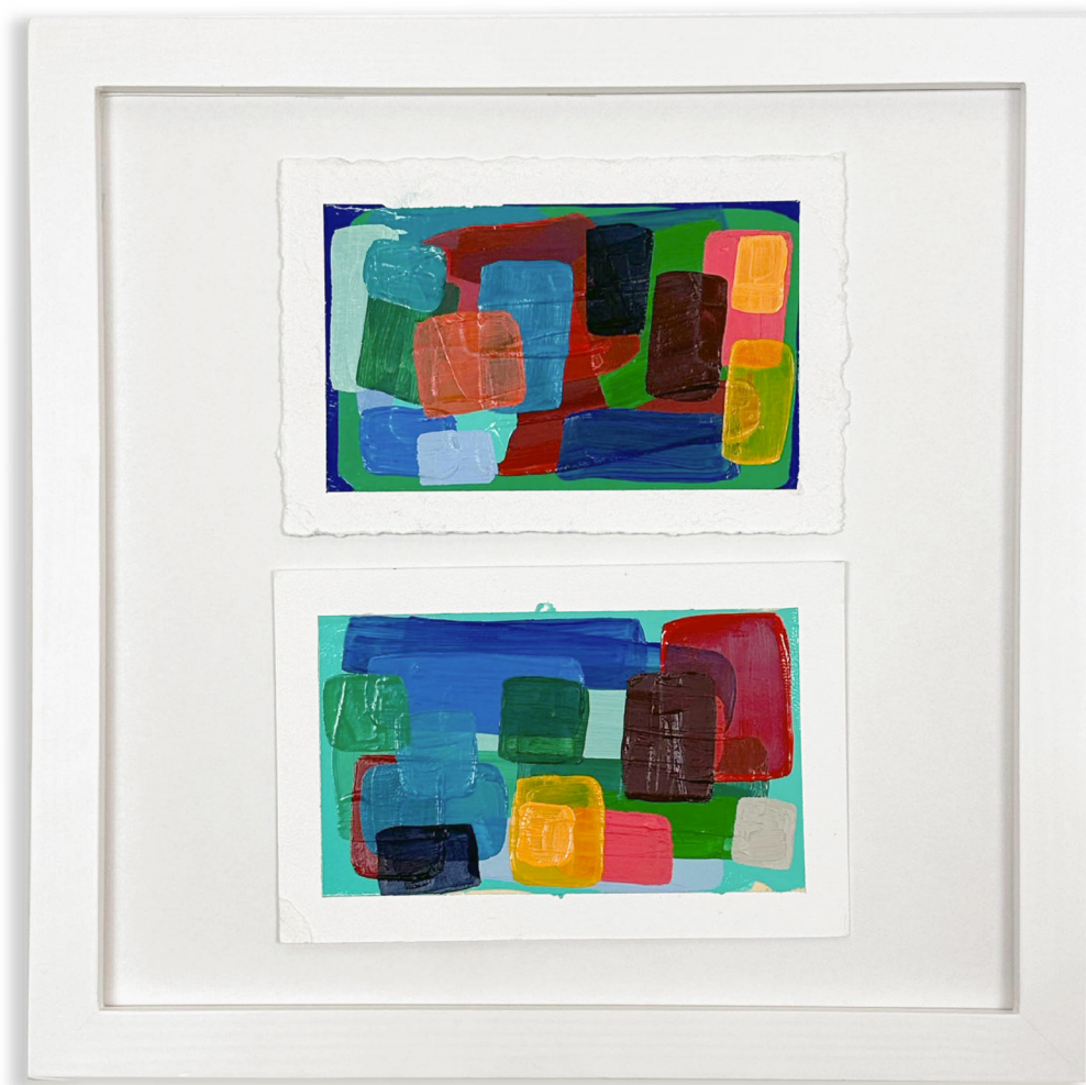
Barriers to Entry, 2023 Oil on paper 4 x 6 inches (10.16 x 15.24 cm) each drawing unframed 10 x 10 inches (25.4 x 25.4 cm) framed SS-SL-23-03