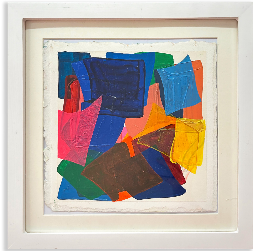
Barriers to Entry, 2023 Oil on paper 8 x 8 inches (20.32 x 20.32 cm) unframed 11 x 11 inches (27.94 x 27.94 cm) framed SS-SL-23-31