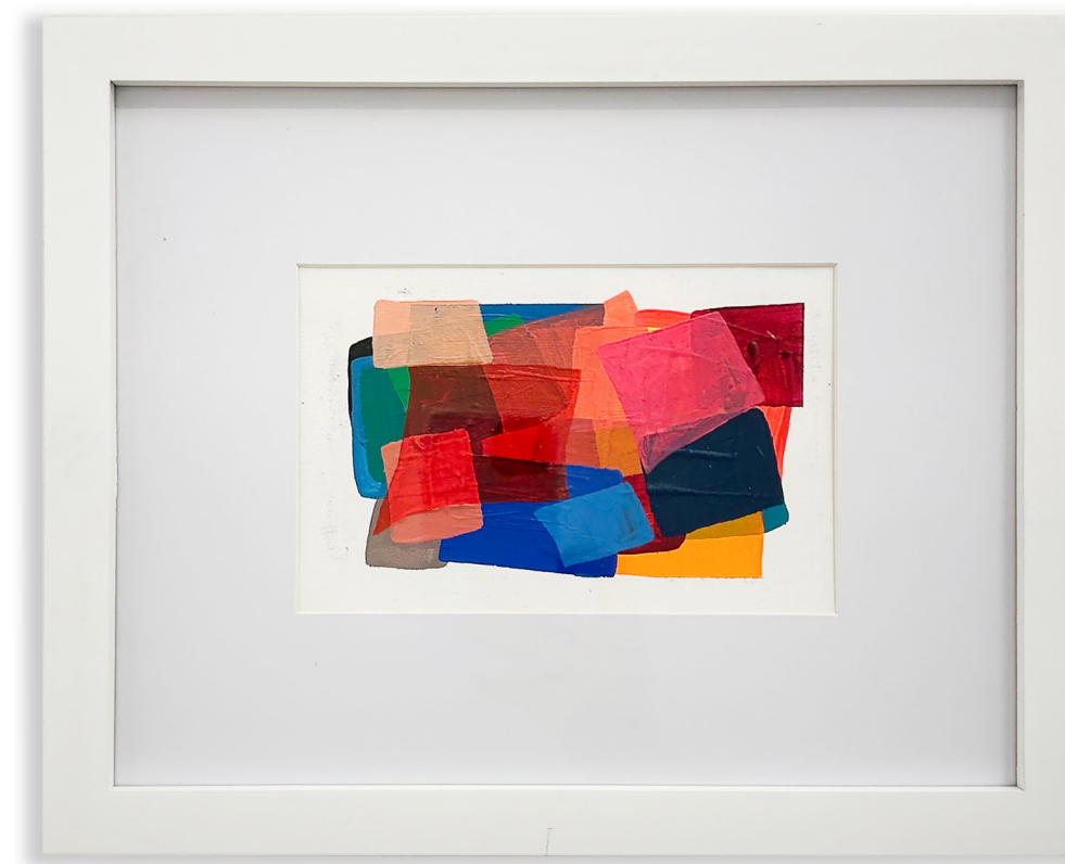
Barriers to Entry, 2023 Oil on paper 4 x 6 inches (10.16 x 15.24 cm) unframed 9.25 x 11.25 inches (23.5 x 28.58 cm) framed SS-SL-23-09