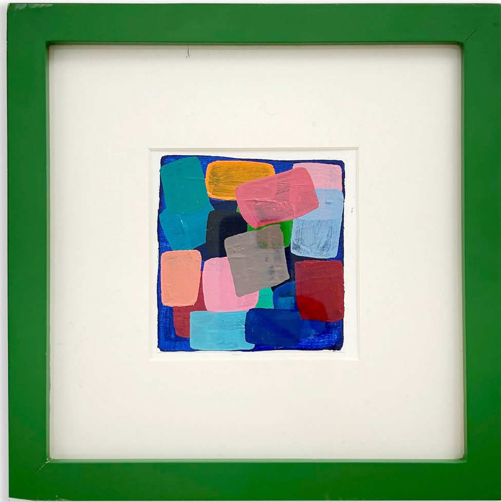
Barriers to Entry, 2023 Oil on paper 4 x 4 inches (10.16 x 10.16 cm) unframed 9 x 9 inches (22.86 x 22.86 cm) framed SS-SL-23-05