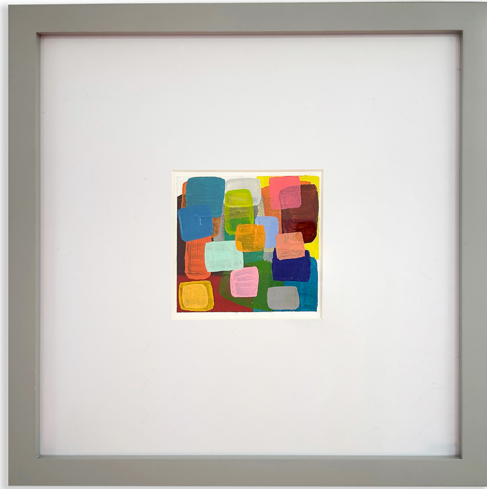
Barriers to Entry, 2023 Oil on paper 5 x 5 inches (12.7 x 12.7 cm) unframed 12.25 x 12.25 inches (31.12 x 31.12 cm) framed SS-SL-23-24