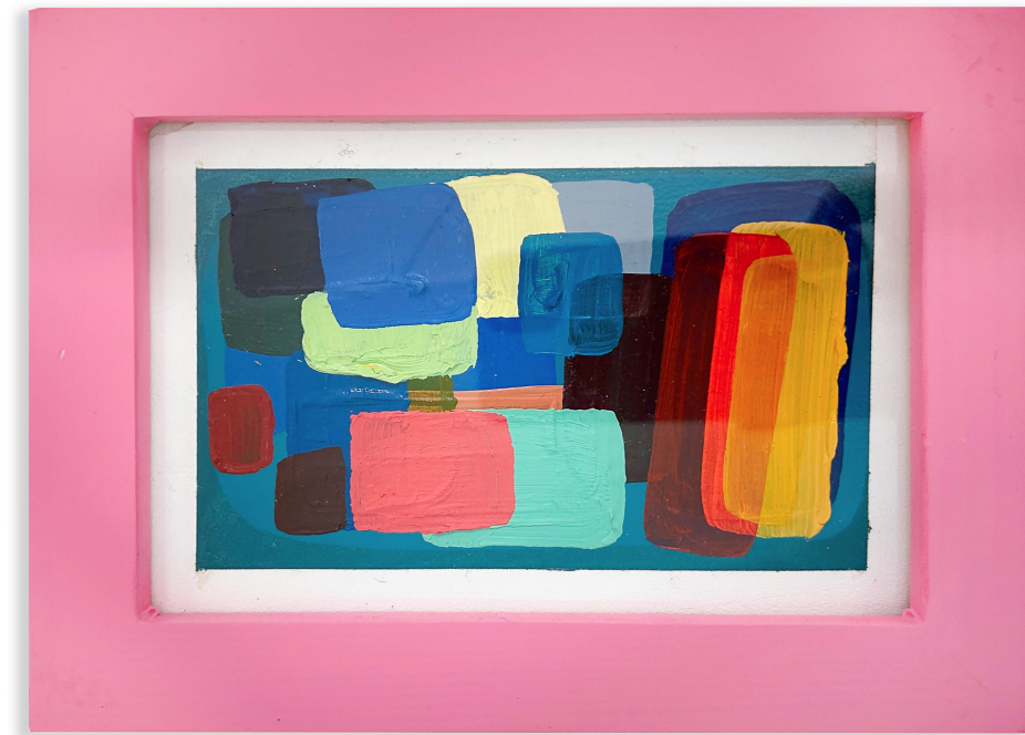
Barriers to Entry, 2023 Oil on paper 4 x 6 inches (10.16 x 15.24 cm) unframed 5.25 x 7.25 inches (13.34 x 18.42 cm) framed SS-SL-23-06