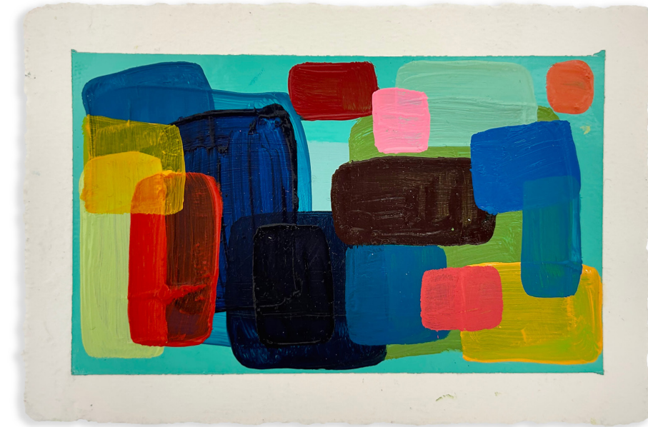
Barriers to Entry, 2023 Oil on paper 3.5 x 5.5 inches (8.89 x 13.97 cm) unframed SS-SL-23-11