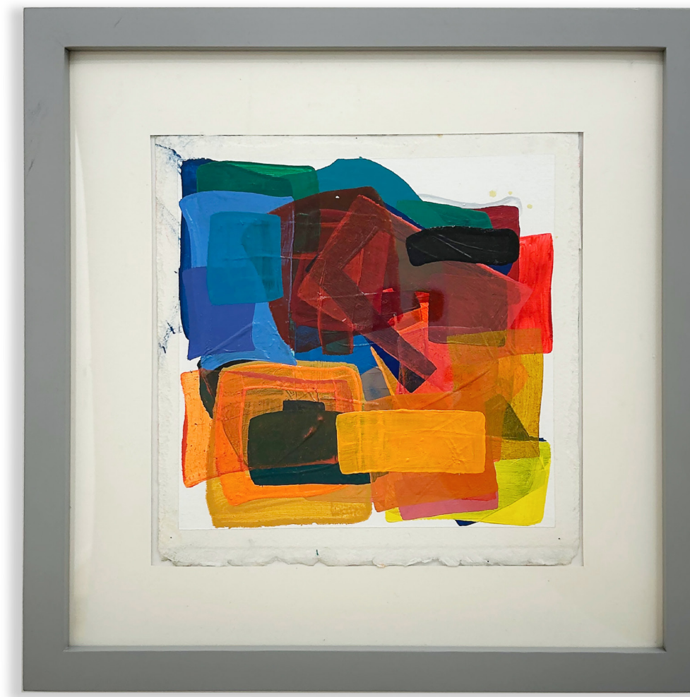
Barriers to Entry, 2023 Oil on paper 8 x 8 inches (20.32 x 20.32 cm) unframed 12.25 x 12.25 inches (31.12 x 31.12 cm) framed SS-SL-23-04