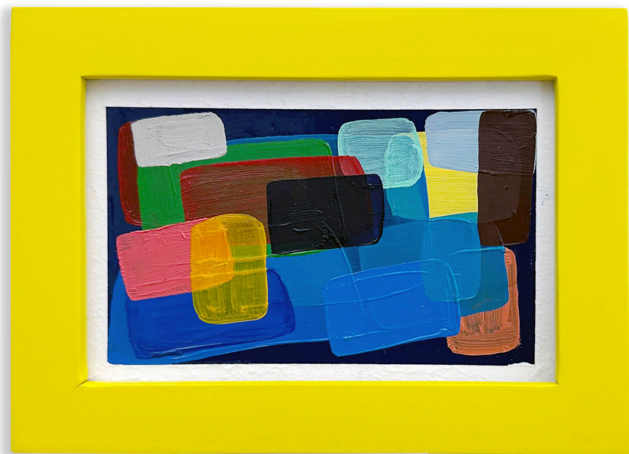
Barriers to Entry, 2023 Oil on paper 3.5 x 5.5 inches (8.89 x 13.97 cm) unframed 5.25 x 7.25 inches (13.34 x 18.42 cm) framed SS-SL-23-08