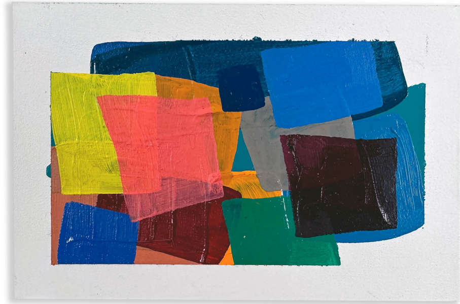
Barriers to Entry, 2023 Oil on paper 3.5 x 5.5 inches (8.89 x 13.97 cm) unframed SS-SL-23-10