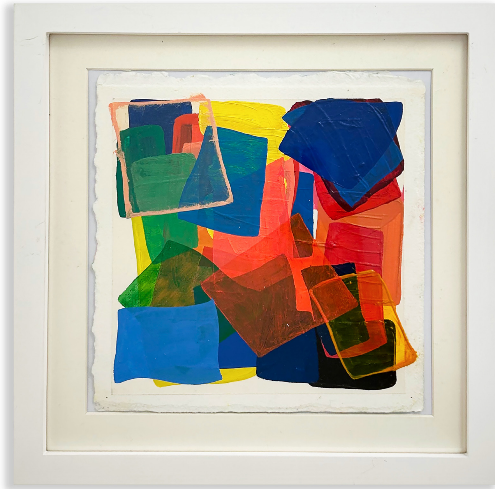
Barriers to Entry, 2023 Oil on paper 7.5 x 7.5 inches (19.05 x 19.05 cm) unframed 11 x 11 inches (27.94 x 27.94 cm) framed SS-SL-23-14