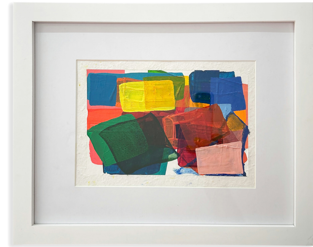
Barriers to Entry, 2023 Oil on paper 4 x 6 inches (10.16 x 15.24 cm) unframed 9.25 x 11.25 inches (23.5 x 28.58 cm) framed SS-SL-23-32